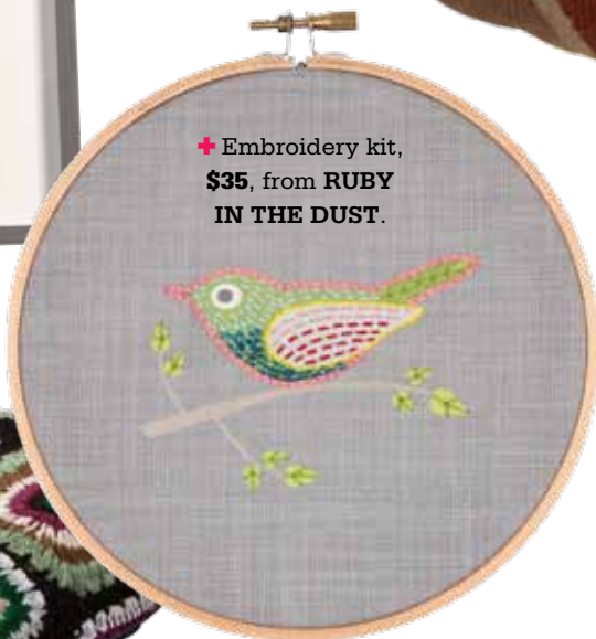
+ Embroidery kit, $35, from RUBY IN THE DUST.