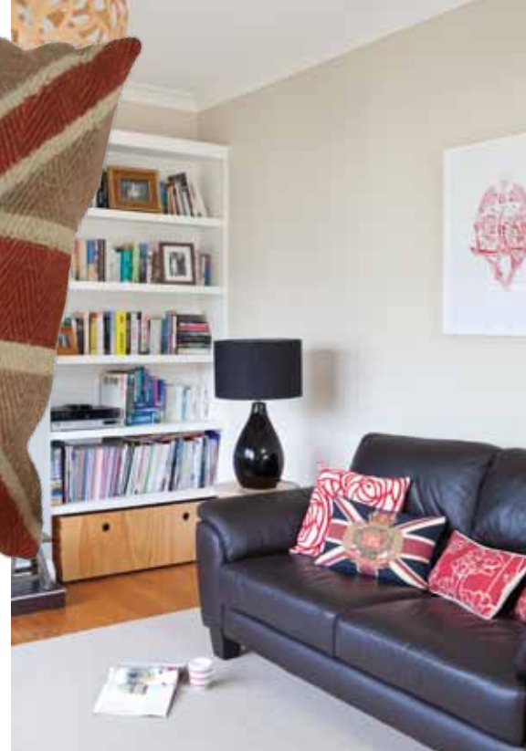
+ Union Jack cushion, $145, from FRENCH COUNTRY COLLECTIONS.