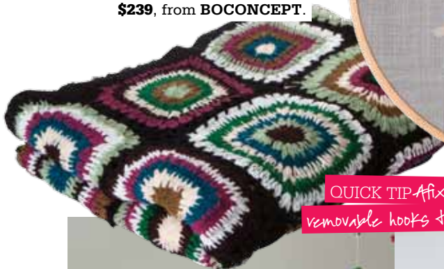
+ Crochet blanket, $239, from BOCONCEPT.

QUICK TIP Affix decorations to your walls with removable hooks that won't mark your paint.